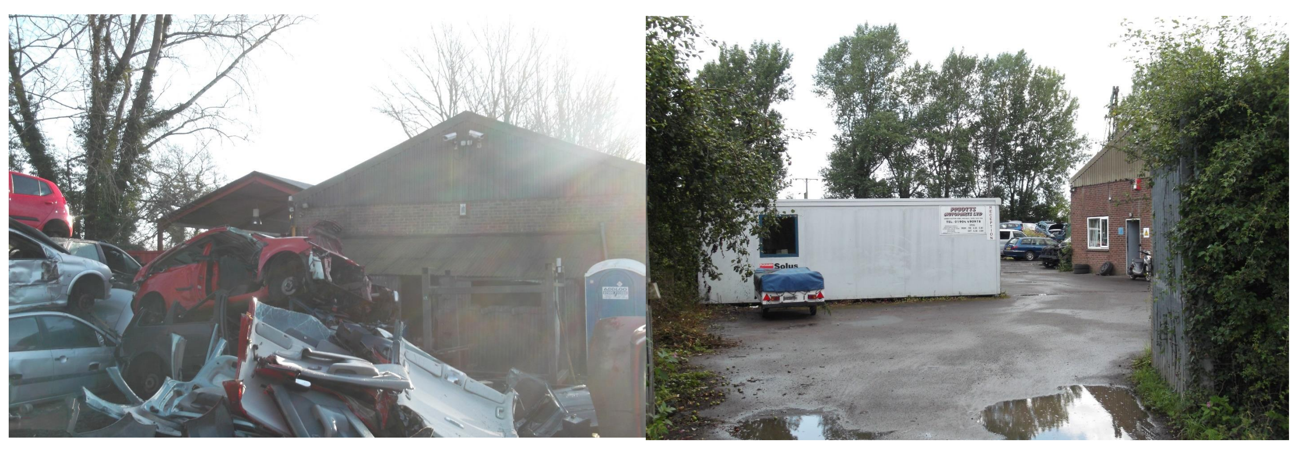
Existing Buildings (3)