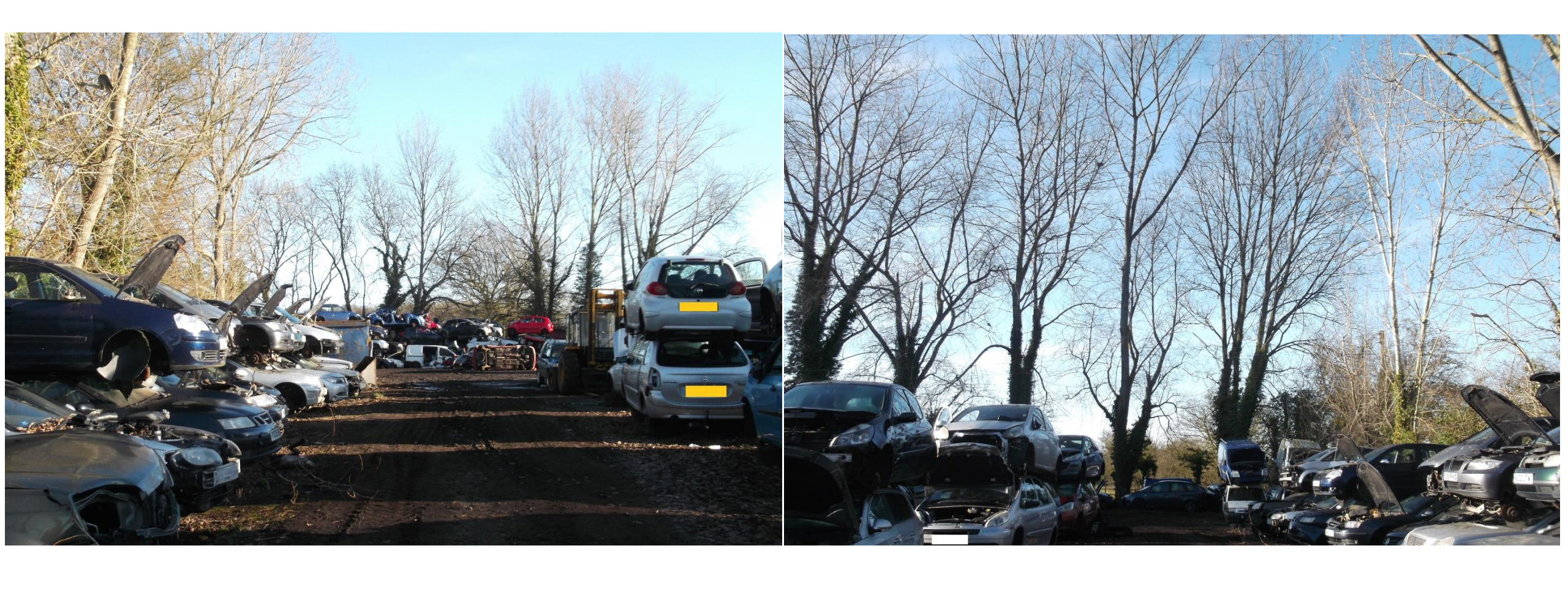
Site in use as Scrap Yard