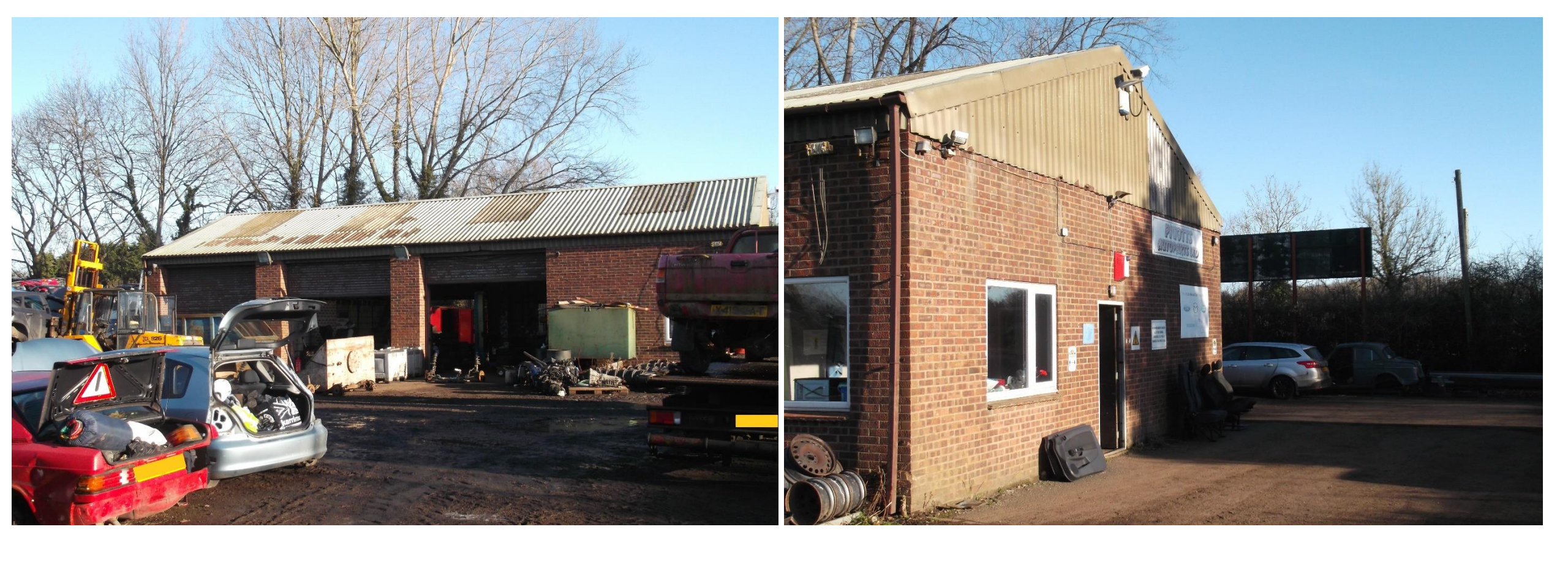
Existing Buildings (1)